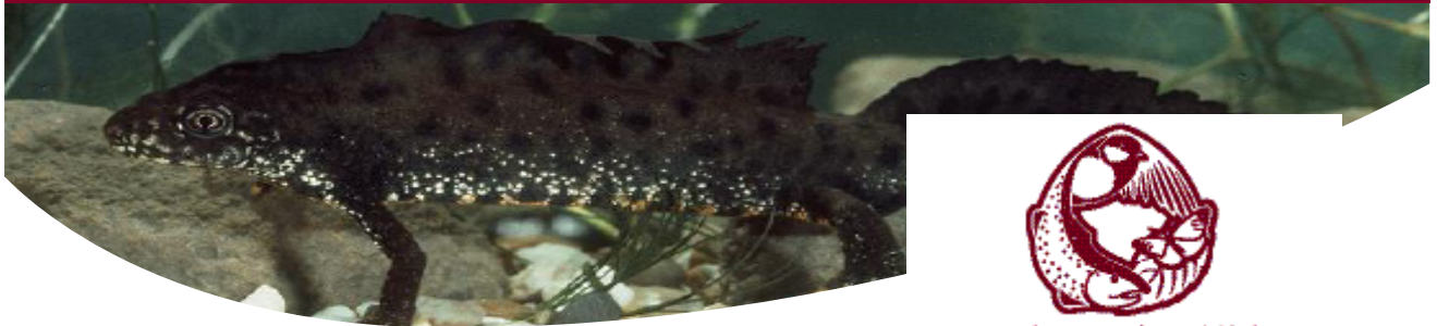
Great Crested Newt