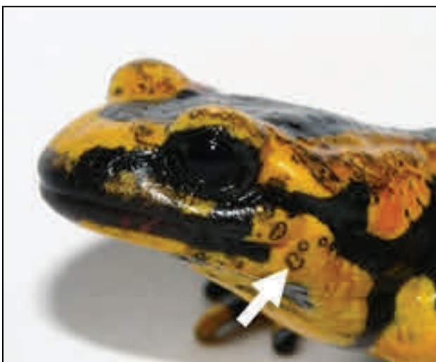
Fire salamander with ulcers on its face. Photo by: Sabino, in Pinto et al. (2015)