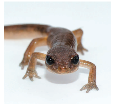
Top border photos courtesy of Crowley (2016): Northern Two-lined Salamander, Spotted Salamander, Red-spotted Newt, Blue-spotted Salamander, Northern Dusky Salamander, Eastern Red-backed Salamander, Four-toed Salamander, Northern Long-toed Salamander, Red-spotted Newt (aquatic). Bottom photo courtesy of Ovaska (2016).