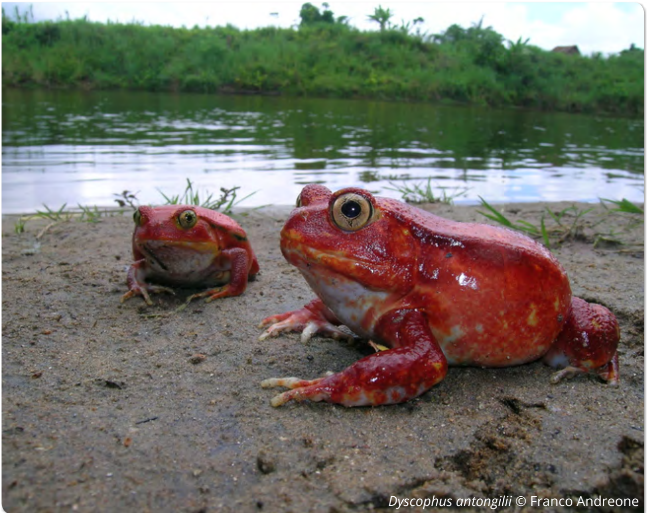
Dyscophus antongilii