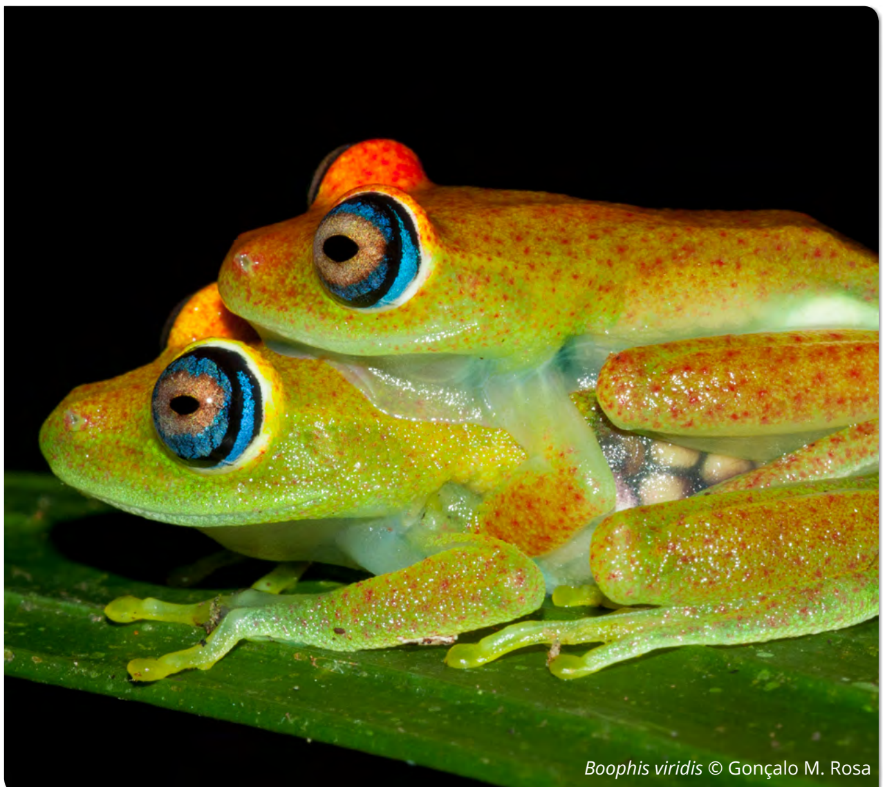
Boophis viridis