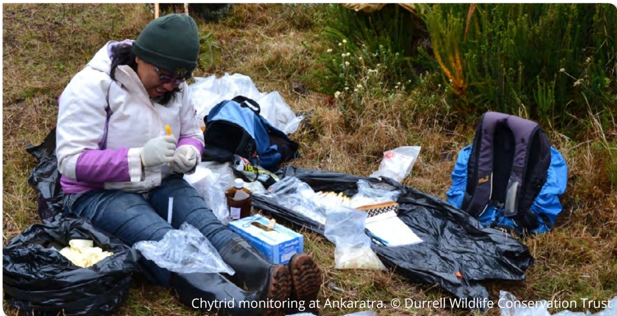
Chytrid monitoring at Ankaratra.

The emergence of infectious diseases is playing a crucial role in the global amphibian decline and a considerable portion of the efforts of the 2008 Sahonagasy Action Plan (SAP) have been invested in this direction.