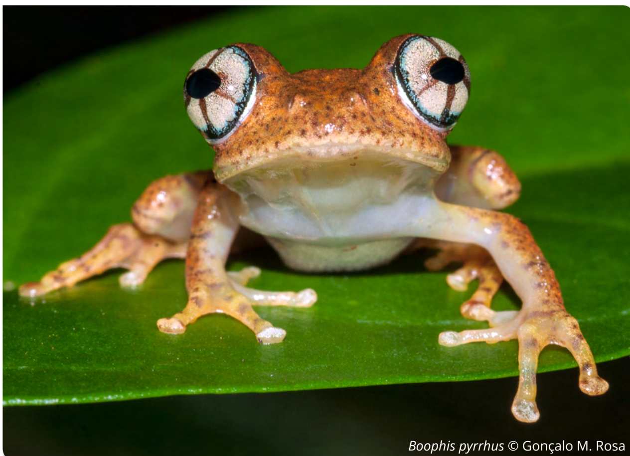
Boophis pyrrhus