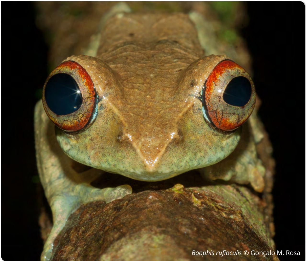
Boophis rufioculis