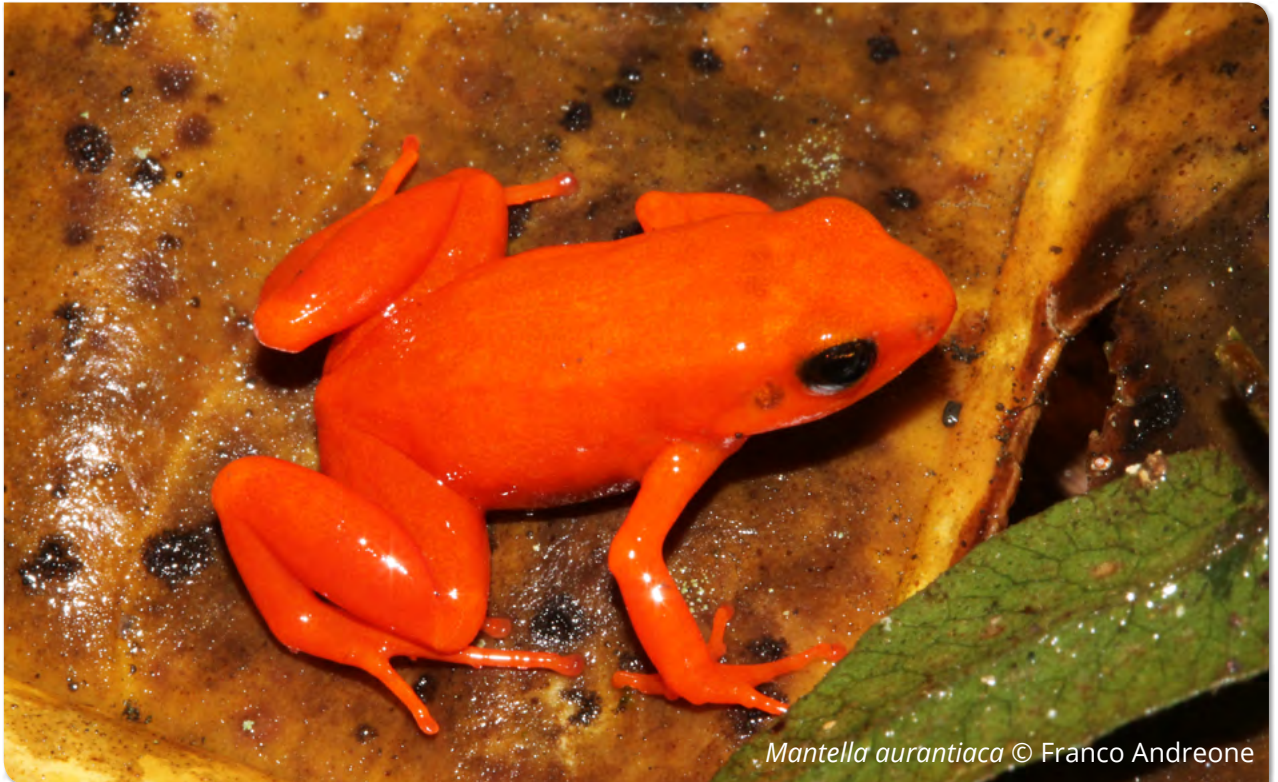
Mantella aurantiaca

Establishing new protected areas for amphibians was one of the key actions of the 2008 Sahonagasy Action Plan (SAP). Since then, two Malagasy conservation organizations have been working to create two new protected areas for amphibians: Association Vondrona Ivon'ny Fampandrosoana who created Ankaratra in the central highlands, and Madagasikara Voakjy (MaVoa,) who created Mangabe-Ranomena-Sahasarotra (Mangabe) in eastern Madagascar.