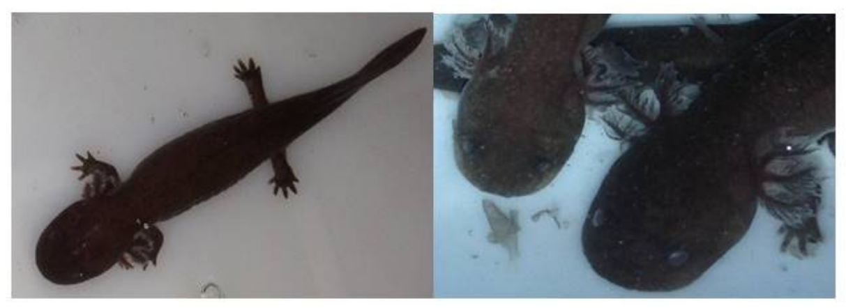
Figure 4. Young Chinese giant salamander larvae with external gills.

Chinese giant salamander larvae measure 2-3cm in total length upon hatching, and they leave the nest at around 4-5cm total length. They have smooth skin with external gills and remain in this form until they metamorphose and lose their external gills at around 20-25cm total length.