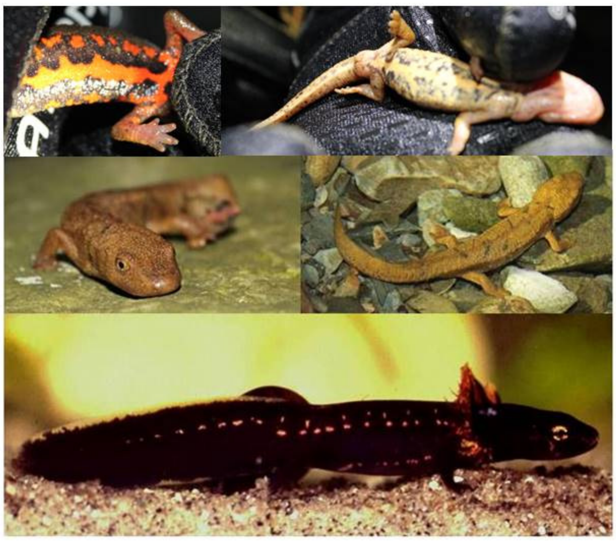
Figure 6. The Warty newt can be found sharing Chinese giant salamander habitat. The picture on the far right is the larvae of this species and should not be mistaken for CGS larvae. Image of larvae © Henry Janssen

Warty newts ( Paramesotriton species), can grow up to 20cm total length. They have a rougher skin than the CGS and their skin is not slimy. Colour varies from species to species but they have black markings on the underbelly and sometimes the belly is orange to red. The larvae can grow to 4cm and are black with a characteristic yellow/white ring around each eye and yellow/white tips to the external gills.