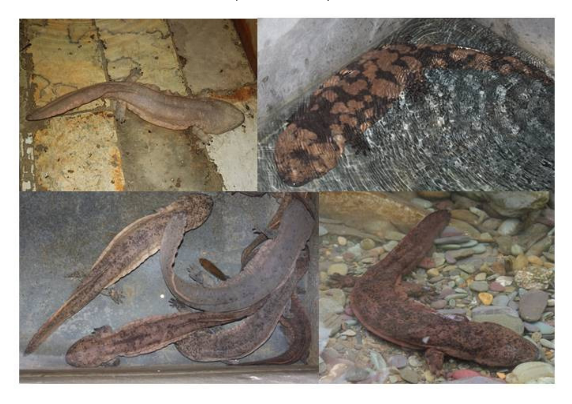
Figure 5. These pictures demonstrate the variation in colour across individuals of Chinese giant salamanders.

Chinese giant salamander adults: These grow up to 1.8m in length and can be distinguished from other salamander species by the folds of skin along their flanks which facilitate percutaneous absorption of oxygen. The skin is smooth and mucus is excreted when they are held. Colour is variable and ranges from light brown to dark brown; some have marbled markings of black and brown. They have a large, blunt and flat head with small nostrils and small eyes which lack eyelids.