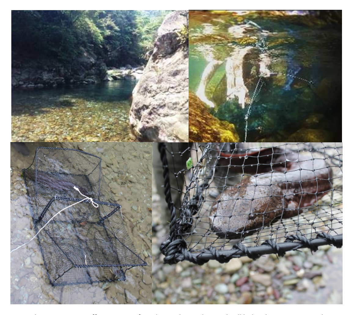
Figure 3. Crab trapping is an effective way of catching salamanders and will help when surveying in low population density.

During night surveys, follow the transect up stream, as lights may startle the CGS and give them an easier route of escape downstream without being detected. The equipment that should be used are nets, waders, wetsuits, snorkel and mask, head torches and dive torches. Walk / wade / swim slowly and scan the river system and look for the CGS, focusing on suitable refuge sites.