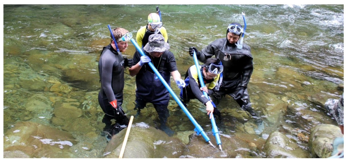
Figure 2. Turning heavy rocks using log peaveys combined with snorkeling during day time surveys will maximise your chance of finding CGS.