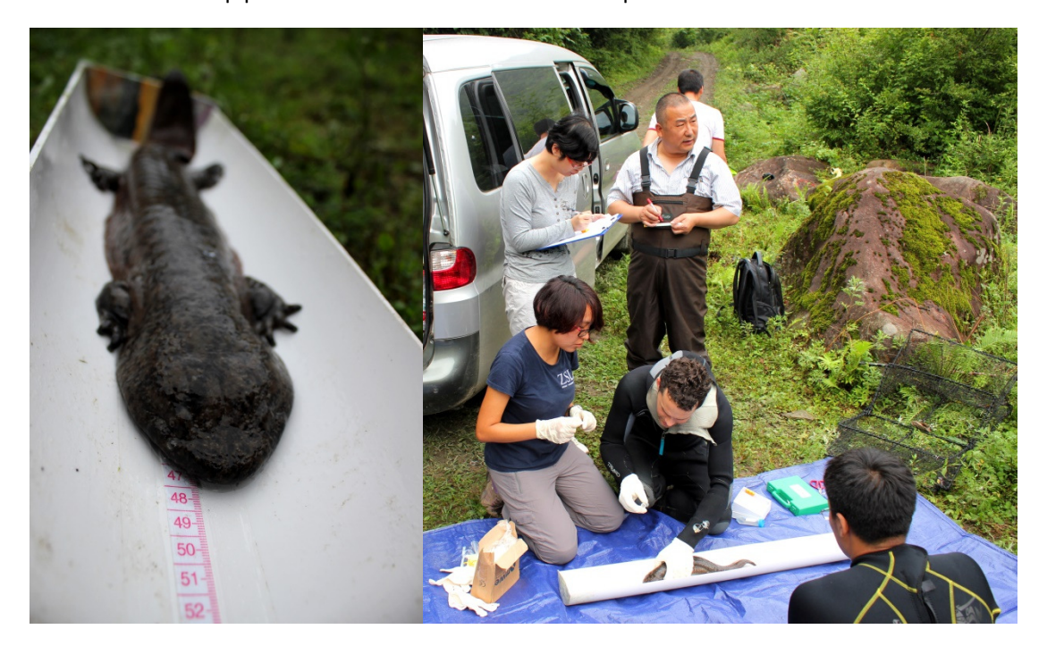
Figure 7. The use of a drain pipe with measure facilitate the collection of morphometric data.

Fill in the form below to record further information for each individual and save electronically